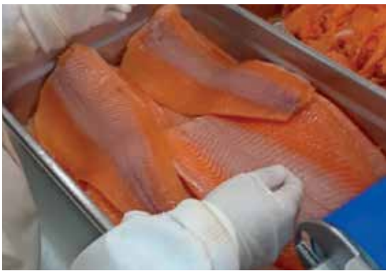
Smoked trout coming out of the V1258 skinning machine (regular skinning)

Capacity: up to 60 pieces/min Working width: 320 mm Water injection: 8 l/min at 2 bars Height, infeed belt: 1050 mm Height, outfeed slide: 780 to 870 mm Height, outfeed belt (optional): 1000 mm Standard power connection: 3 x 400 V, 50 Hz* Power consumption: 1 x 0.55 kW Noise level: 65 dB (A)