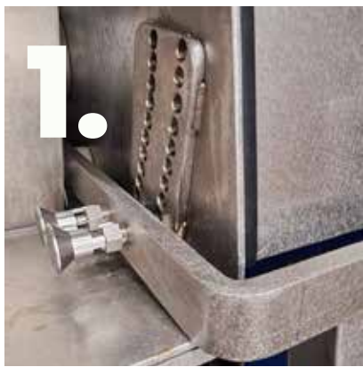
The V1258 machine has a notch thickness adjustment system.